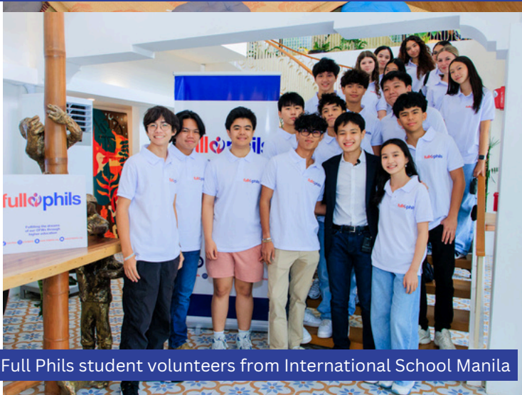
Full Phils student volunteers from International School Manila